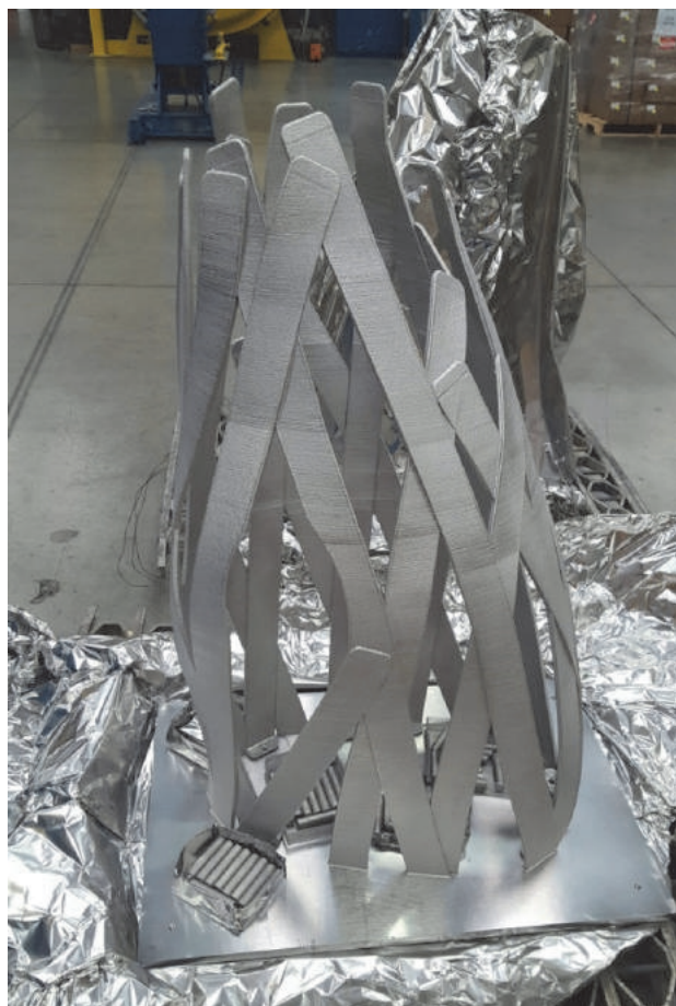
Fig. 2 — Decorative part for the yacht “Hollow Ribbons” made using DMLS.

of similar material within a vacuum chamber. The process deposits material at a higher rate than DMLS, but the finished shape is not as fine. Material for EBAM parts that are vacuum heat treated is predominantly Ti-6Al-4V (Fig. 3).