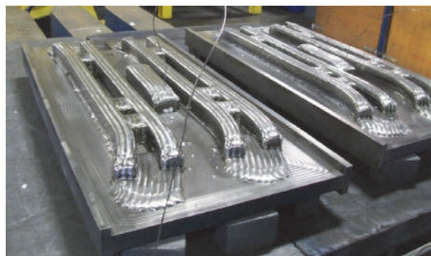
Fig. 3 — EBAM is used to deposit titanium wire on a titanium base.

AM is rapidly developing due to the demand for near-net shape parts with geometries that are impossible to machine. Because AM parts require very little material removal during downstream processing, it is imperative that finished parts do not have any decarburization or contaminated surfaces from subsequent thermal processing. Therefore, a