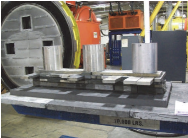
Fig. 7 — Creep-forming is used to flatten a warped EBAM titanium baseplate by placing weights on the part during heat treatment.

three vacuum heat treating processes per various aerospace standards—vacuum annealing, vacuum aging, and vacuum stress relieving.