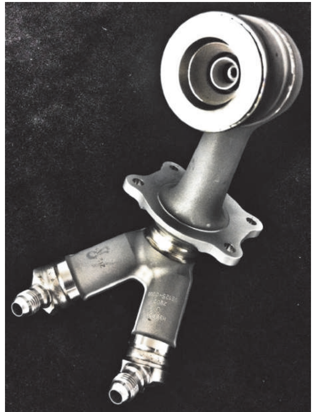
Fig. 1 — DMLS one-piece fuel nozzle is the first FAA-cleared 3D printed part to fly in a commercial jet.

Therefore, the big challenge facing the AM industry is to identify new, effective quality assurance techniques. In most cases, certification and validation initiatives for AM products are being driven by primary contractors such as General Electric Aviation and Lockheed Martin. GE has spent millions of dollars on mass inking and qualifying a very intricate fuel nozzle (Fig. 1) made using direct metal laser sintering for use on next-generation LEAP (leading edge aviation propulsion) high-bypass turbofan engines. The one-piece printed fuel