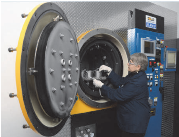
Fig. 5 — AM-capable vacuum furnaces range from lab size to 48 ft long.